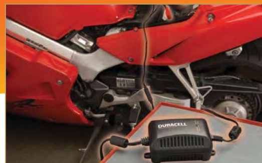
2 Amp Battery Maintainer