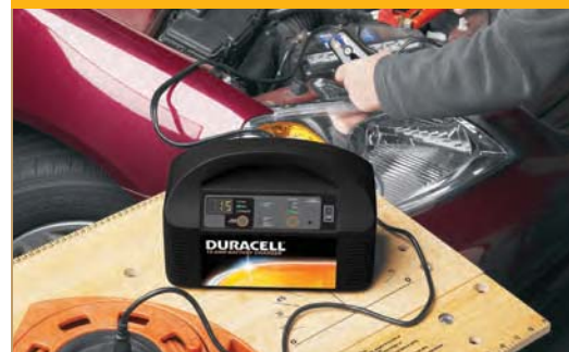
15 Amp Battery Charger