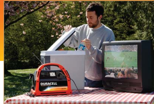
Portable power anywhere